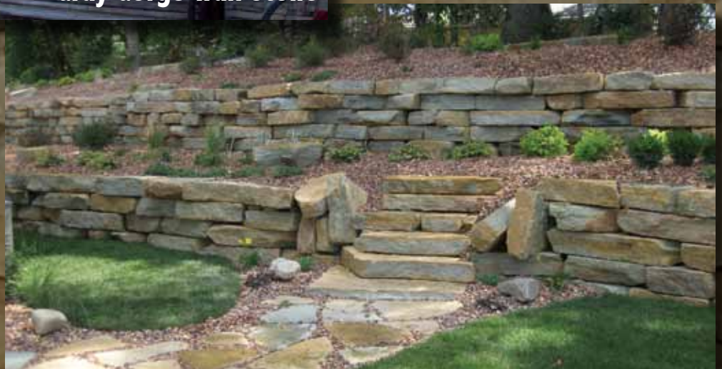
Southern Buff Outcroppings/Slabs