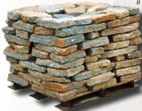
Southern Buff Select 3" Wall Stone Natural Wall Stone # 41103

2" thick = 16-18 Square face feet per ton @ 12" high 3" thick = 14-16 Square face feet per ton @ 12" high 4" thick = 12- 14 Square face feet per ton @ 12" high 5" thick = 29 - 31 linear footage per ton @ 1 course high