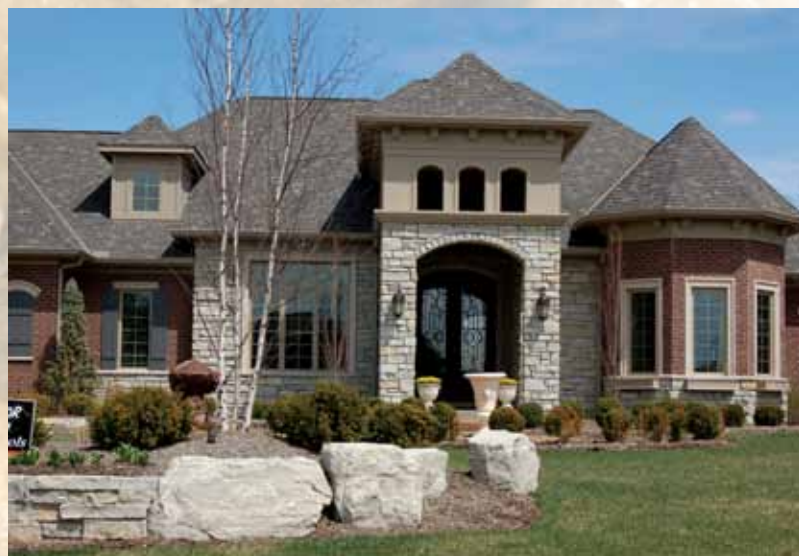
Canyon Gray Veneer