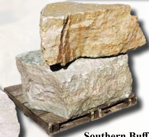
Southern Buff 22" -25" Thick Chunks # 43132