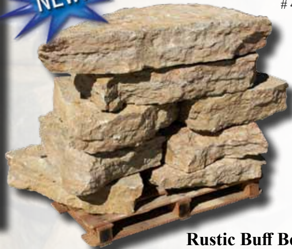
Rustic Buff Beige 8.5" - 9.5" Outcroppings # 33158