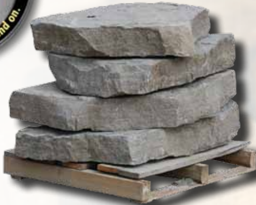
Gray Gorge 6"- 8.5" Outcroppings # 13106