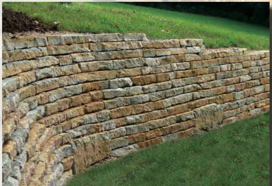
Southern Buff Wall Stone used in retaining wall