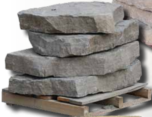
Gray Gorge Natural Steps 3' -4' # 12102