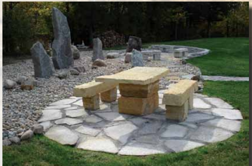
Gray Gorge Flagging