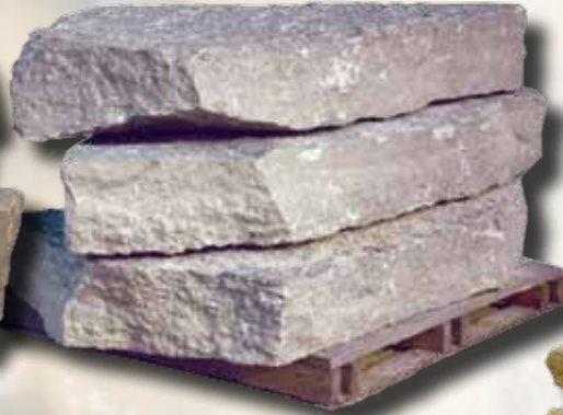
Canyon Gray 9.5" - 10.5" Slabs # 53109