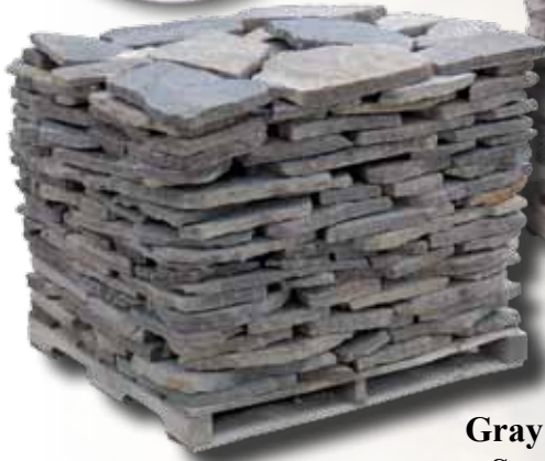
Gray Gorge Steppers # 12120