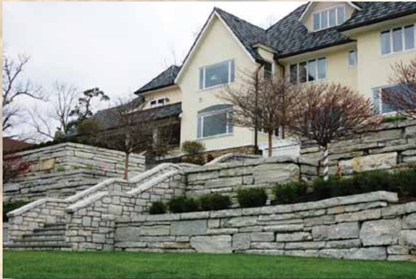
Canyon Gray 6" - 10" & 20" Outcroppings/Slabs