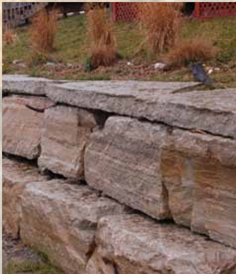
Canyon Tan 25" Chunks