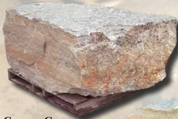
Canyon Gray 25" Chunks # 53133