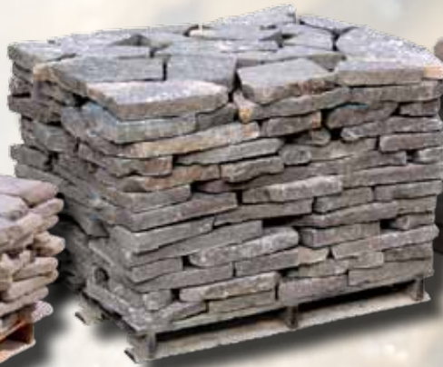
Gray Gorge Select 2" Wall Stone # 11102

2 Linear footage = Length @ 1 course high