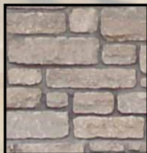
Canyon Gray/Tan # 51240