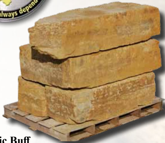
Rustic Buff 13"- 14" Benches # 33140