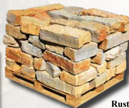
Rustic Buff 5" x 8" Cut Wall Stone # 31205

Cutwall (split) Wall Stone Canyon Gray only