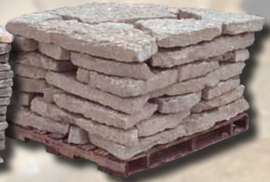
Canyon Gray Select Thick 3" Wall Stone # 51150