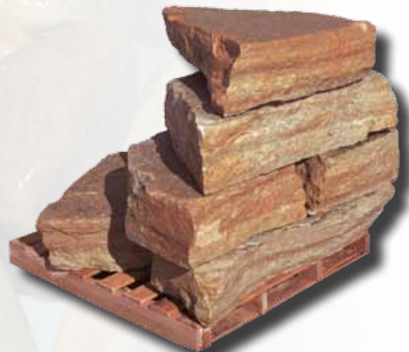
Rustic Buff 9.5" - 10.5" Slabs/Outcroppings 9