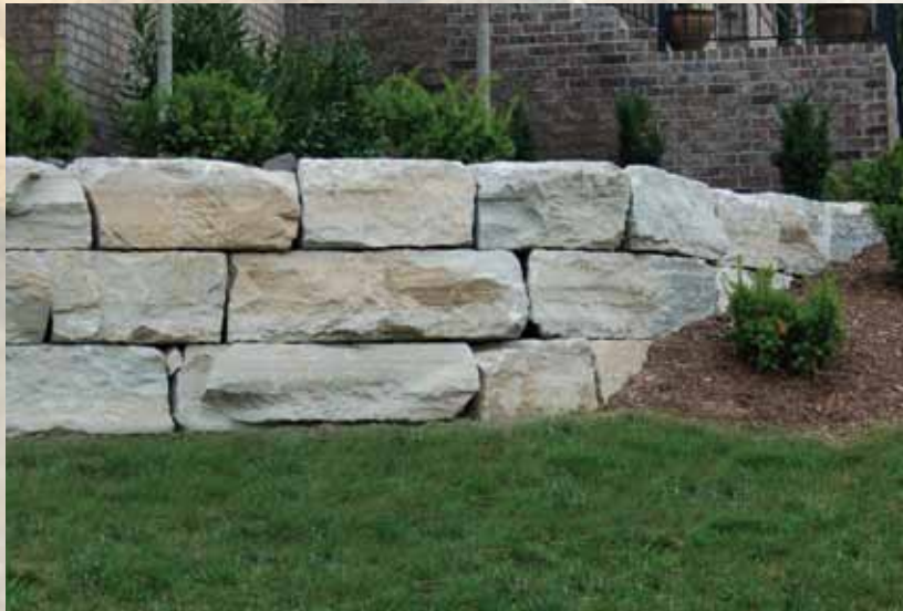
Canyon Tan 16" Outcroppings/Chunks