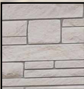
Indiana Limestone # 101221