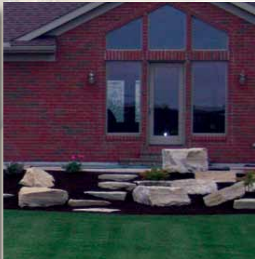
Canyon Tan Accent Boulders & Chunks