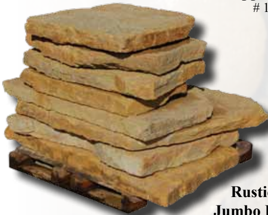
Rustic Buff Jumbo Flagging # 32114