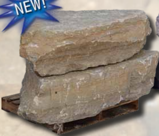
Canyon Tan 16" Outcroppings/Chunks # 63131