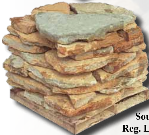
Southern Buff Reg. Large Flagging # 42113