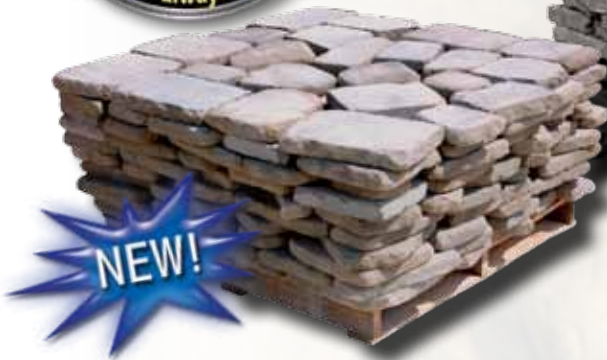
Tumbled Indiana Limestone 2" Weathered Edge # 101219