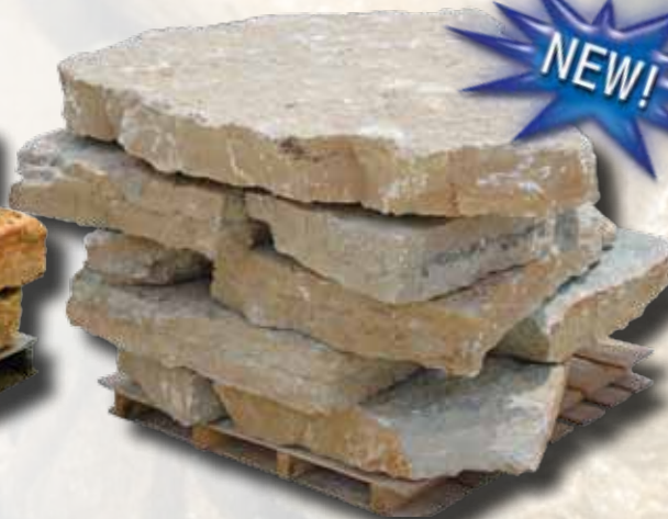
Rustic Buff Biege 6"- 8.5" Outcroppings # 33156