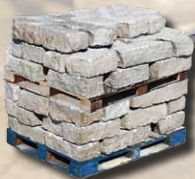
Canyon Gray 6" x 8" Cut Wall # 51206