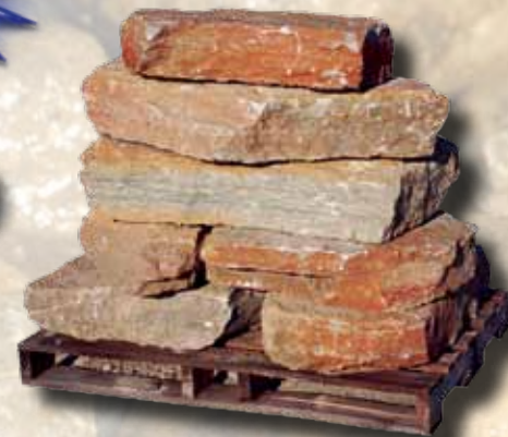
Southern Buff 6"- 8.5" Outcroppings # 43106