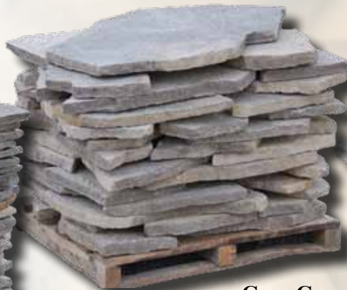
Gray Gorge Thin Large Flagging # 12112