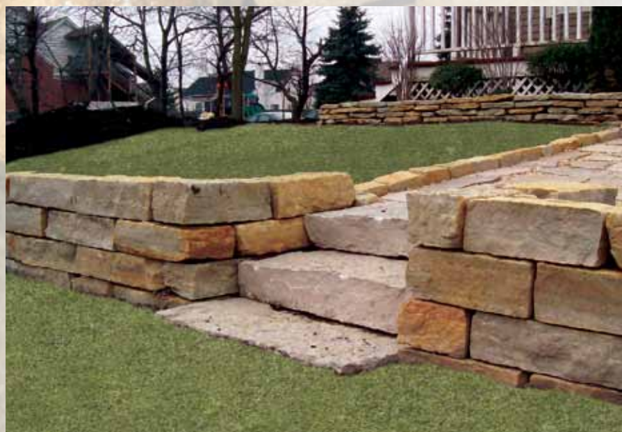
Rustic Buff 5" x 8" Cut Wall used in retaining wall

3" thick x 8" depth = 19-21 square face feet per ton 4" thick x 8" depth = 19-21 square face feet per ton 5" thick x 8" depth = 34 -38 linear feet per ton 6" thick x 8" depth = 17-19 square face feet per ton or 34-38 linear footage per ton 6" thick x 12" depth = 10-12 square face feet per ton or 20-22 linear footage per ton