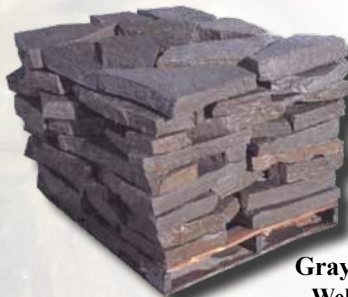
Gray Gorge Web Wall # 11110