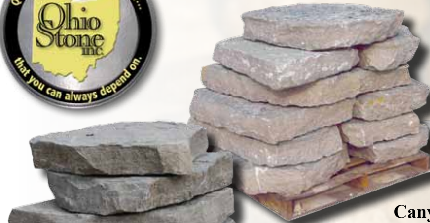
Canyon Gray Mini Steps 2' - 3' # 32101