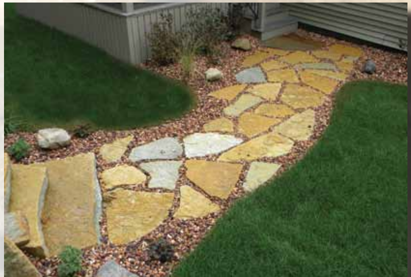
Southern & Rustic Buff Flagging