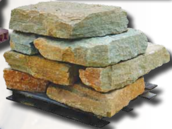
Southern Buff 8.5" - 9.5" Outcroppings # 43108