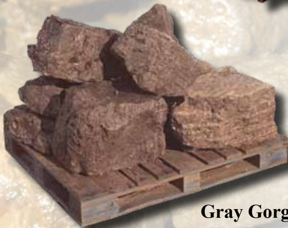
Gray Gorge Boulders # 14101