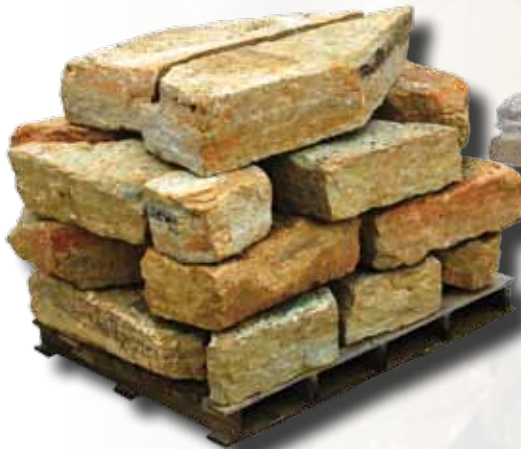
Rustic Buff 7"- 8" Lil' Chunkies # 33130