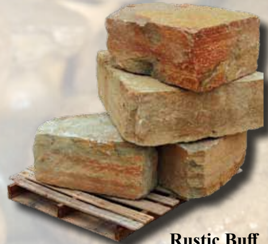
Rustic Buff 13" - 14" Chunks # 33131