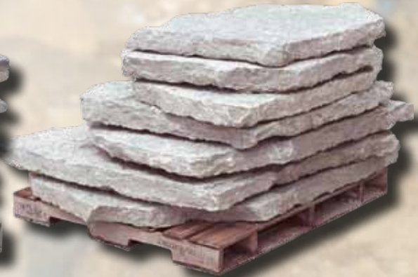
Canyon Gray Jumbo Flagging # 52113