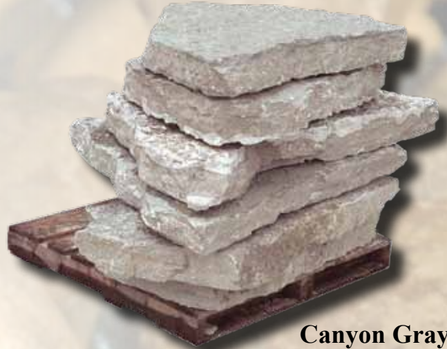
Canyon Gray 6" - 8.5" Slabs # 53106