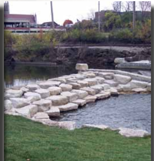
Canyon Gray 25" Chunks