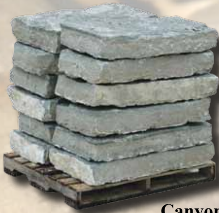
Canyon Gray 36\"/>