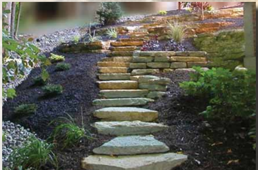
Southern Buff 6"- 8" Slabs

Example: A slope (hill) which is 72 inches high (6 feet) would require 12 pieces of 6" step/ treads (72 inches divided by 6 inches = 12 pieces) Coverage may vary depending on field conditions & depth of stone used