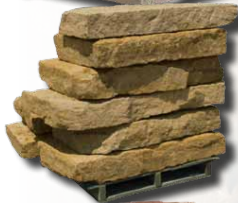
Rustic Buff Natural Steps 3' -4' # 32102