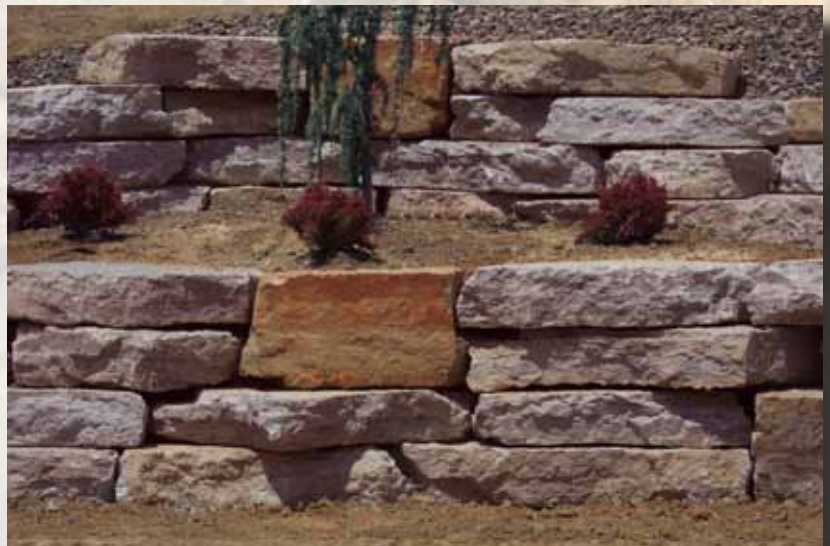
Rustic Buff Beige Outcroppings with Rustic Buff Chunks

8 Linear footage = Length @ 1 course high