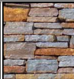
Southern Buff # 41240