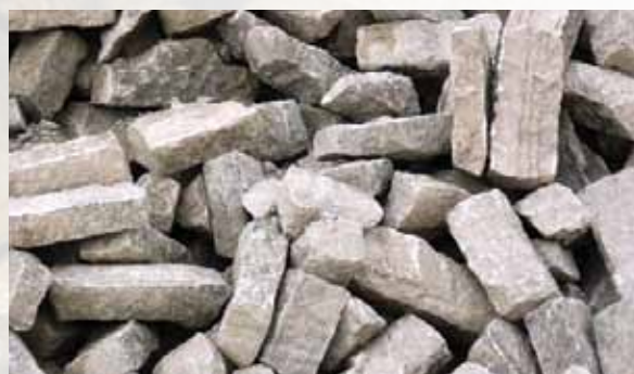
Canyon Gray "Bulk" Split Veneer-Rubble Building Stone # 51240