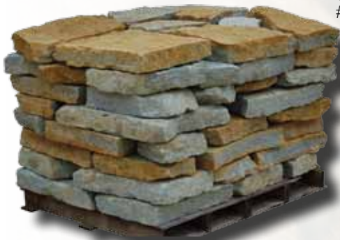
Rustic Buff Select Thick 3" Wall Stone # 31150