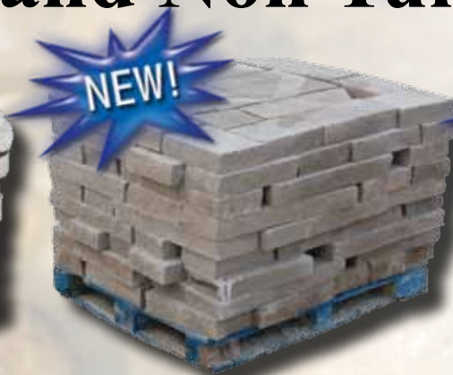
Indiana Limestone 3" x 8" Cut Wall Stone # 101203