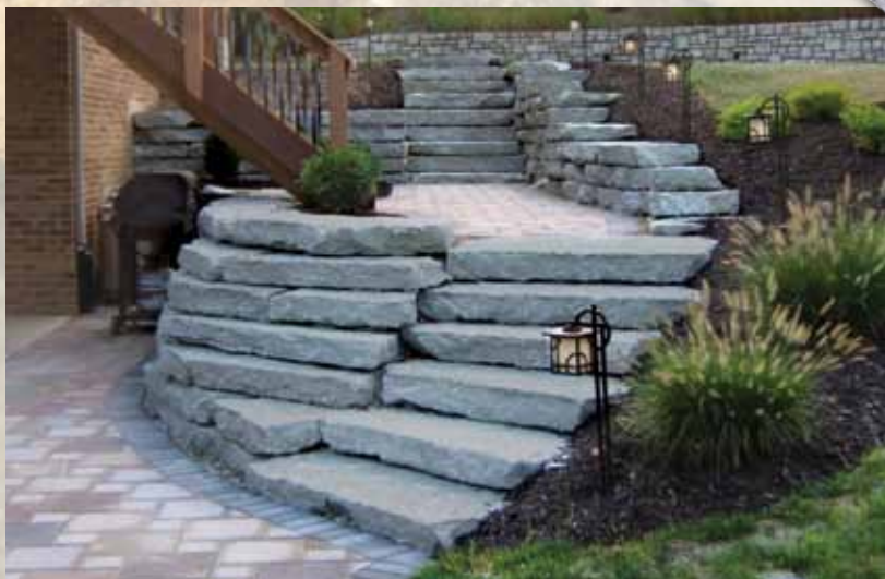
Canyon Gray 36\"/>

Custom products available through Elliot Stone Company include Rock Faced and Bullnosed Pier Caps, Treads, Sills, Coping, and Patterned Flagging. View their entire product line at