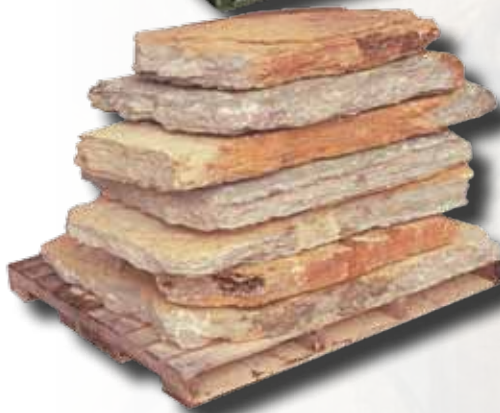
Southern Buff Natural Steps 3' -4' # 42102