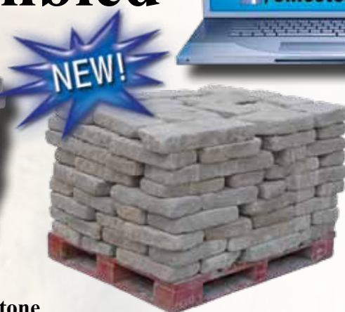
Indiana Limestone Tumbled 3" x 8" Cut Wall Stone # 101213