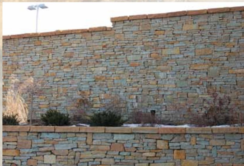
Southern Buff Veneer