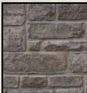
Gray Gorge # 11240