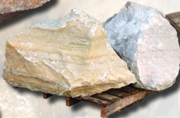
Canyon Gray/Tan Accent Boulders # 66101