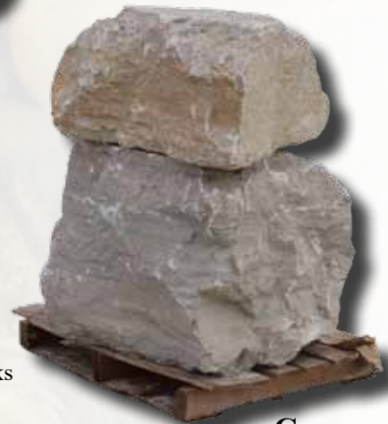
16" Chunks # 63131