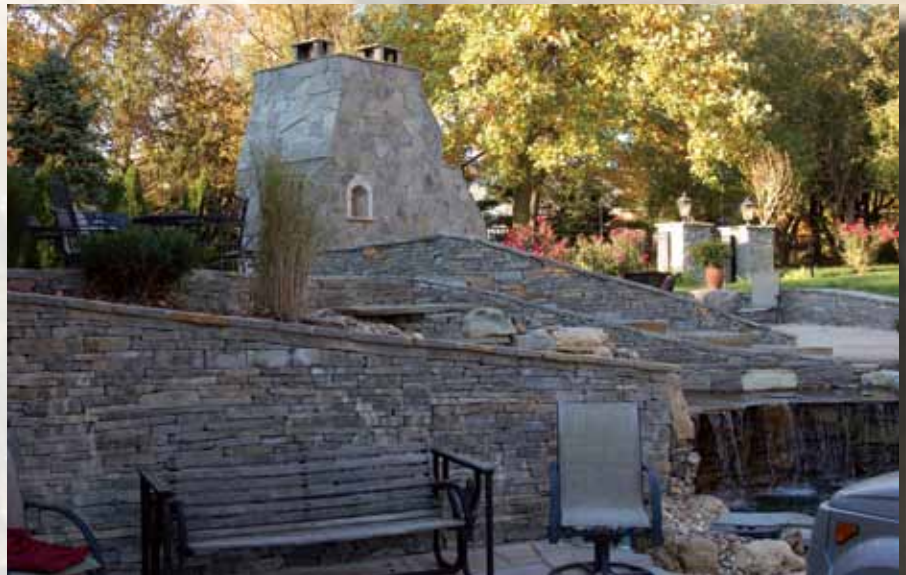
Gray Gorge Wall Stone used in retaining wall