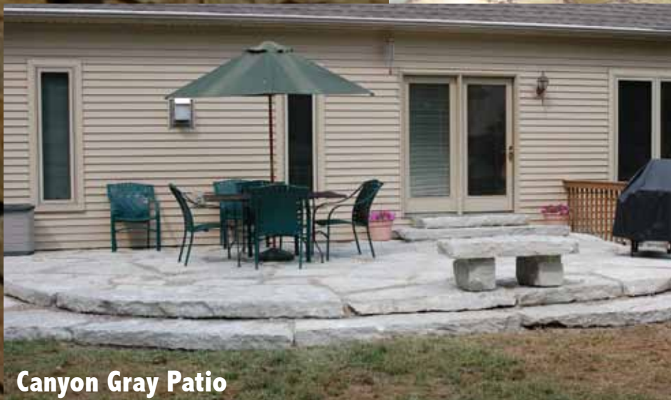
Canyon Gray Patio