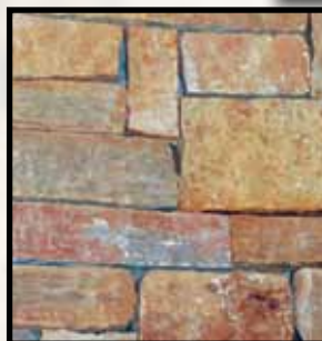
Rustic Buff # 31240